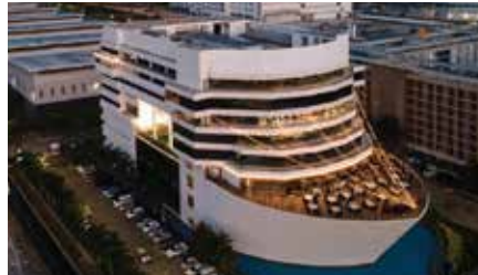
The Ship Campus Batu Kawan, Penang