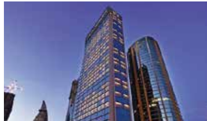
VE Hotel, Bangsar South, KL