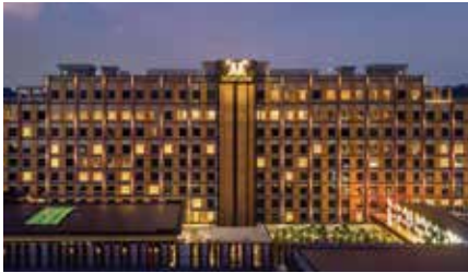
KGPA Resort & Spa, KL