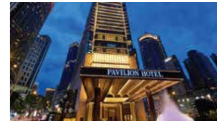
Royal Pavilion, KL