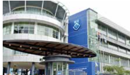
Monash University, Johor Bahru