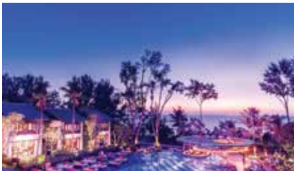
Bababeach Club Huahin, Thailand