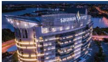
Sarawak Energy Berhad Headquarter