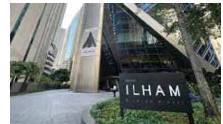
Menara Ilham, KL (CEO Office)