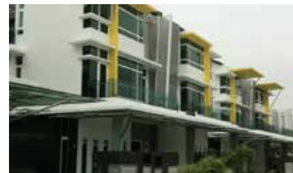
Laman Damaisari, Mont Kiara