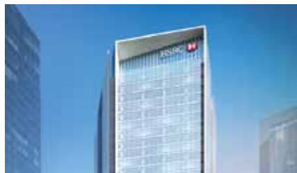
HSBC Tower@TRX, KL