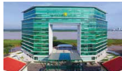
Menara RH, Miri