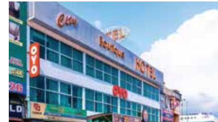
Boutique Hotel, Bangi