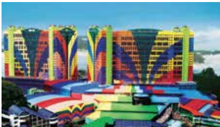
First World Hotel