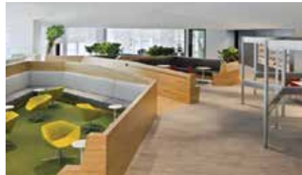
BHP Billiton Office, KL