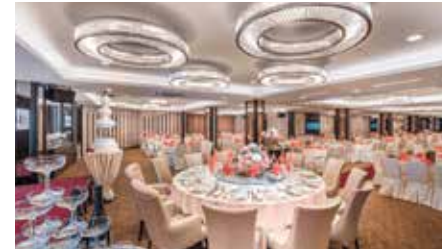
Grand Harbour, Damen Mall