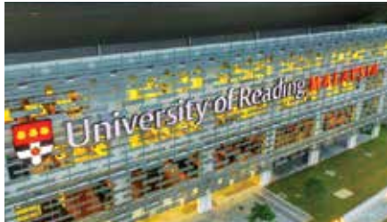
University of Reading Malaysia