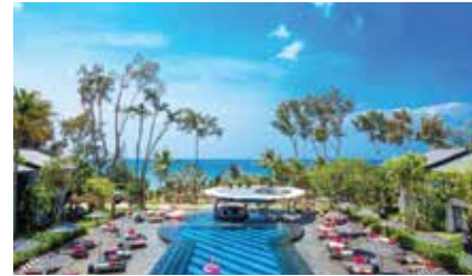
Bababeach Club Natai (Phuket), Thailand