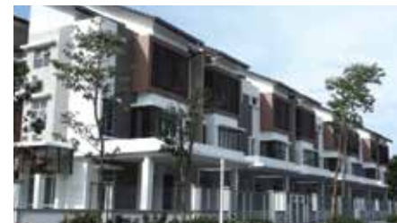
Tropicana Pool Villa, 24 Units