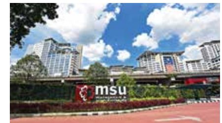
Management & Science University (MSU)