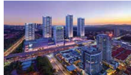
Tropicana Garden Mall, Selangor