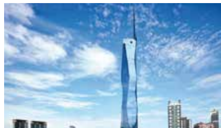
Menara PNB 118, Malaysia Tallest Building