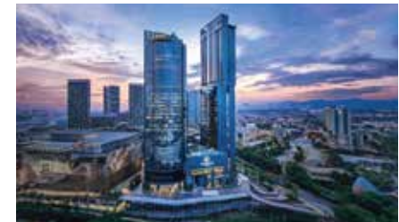
DoubleTree By Hilton I-City