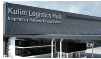
PKT Kulim Logistics