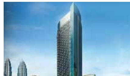
Banyan Tree Suites, KL