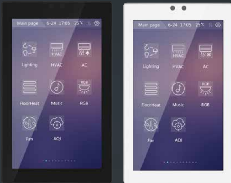
TOUCH PANEL 5 INCH