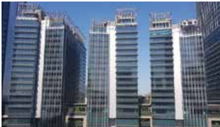
KL EcoCity Boutique Offices, KL