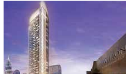
Bayan Tree Signature Pavilion