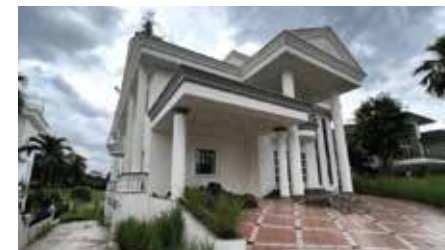
Tropicana Golf Villa, 12 Units