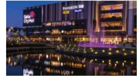
Setia City Mall