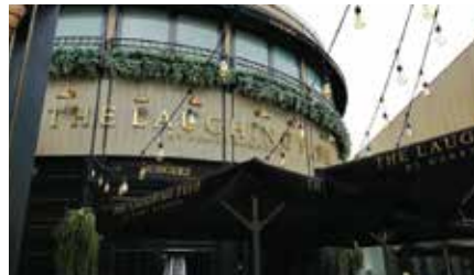
Harry Ramsden, Genting