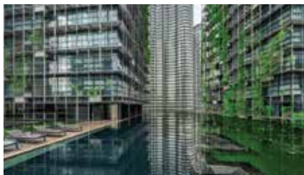
Le Nouvel KLCC