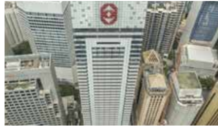
Menara Public Mutual