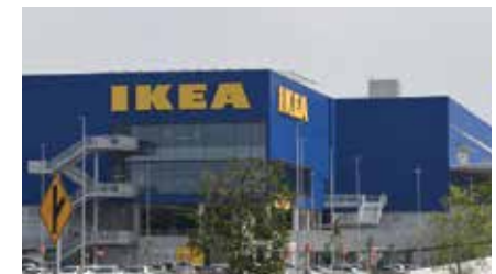
IKEA Batu Kawan, Penang