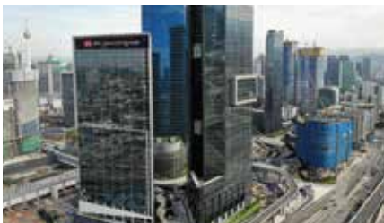
Affin Bank HQ@TRX, KL