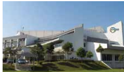
Greentech Malaysia, Bangi Malaysia 1st Green Building