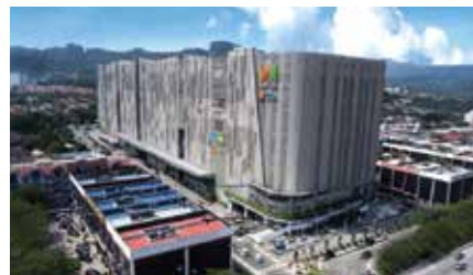
Melawati Mall, KL