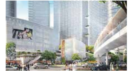
Mitsui Retail Mall, KL