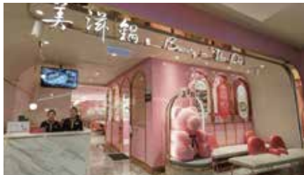
Restaurant Beauty In The Pot Garden Mall