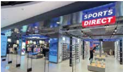
Sport Direct, Sunway Pyramid