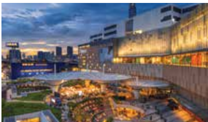
IKANO MyTown, KL