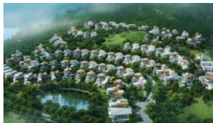
Nadayu Melawati, 56 Units