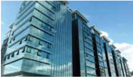
Bangsar South Horizon 8 Block Office