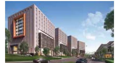
Putrajaya Parcel Z, Putrajaya