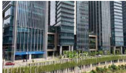
KL EcoCity Mercu-3, KL