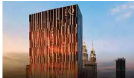
Hotel EQ, KL