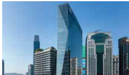
YTL Headquarters, KL