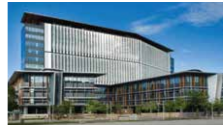
Putrajaya Holding Lot 2C2