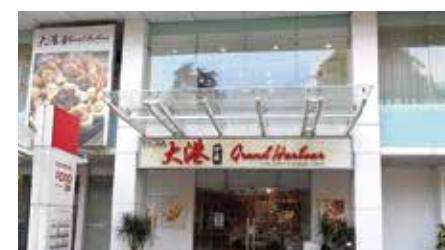
Grand Harbour, Farenheit