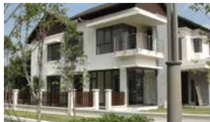
Amania Damandara Idaman, 40 Units