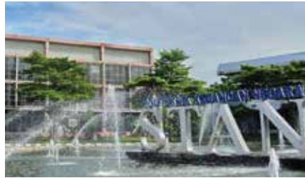
Indonesian State College of Accountancy (STAN), Indonesia