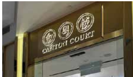
Canton Court, Pavillion KL