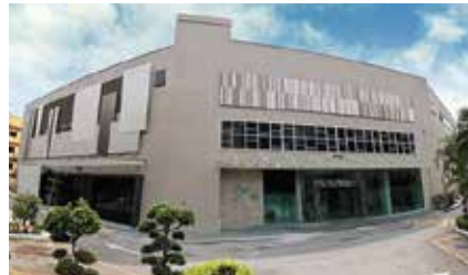
Golden Sun, Kuchai