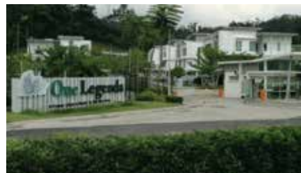
One Legenda Cheras, 28 Units