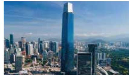
The Exchange 106, KL (Mulia Office)