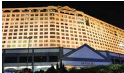
Maxims Hotel Genting