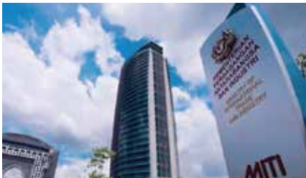
Menara Ministry of International Trade & Industry (MITI)