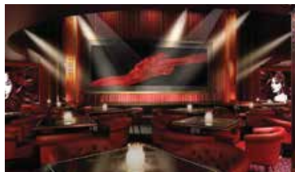
Genting Club@Resorts World, Pahang