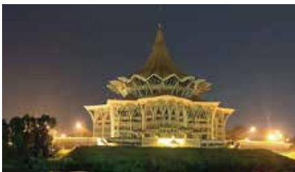
D.U.N Kuching, Sarawak