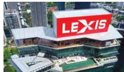
Imperial Lexis Hotel, KL